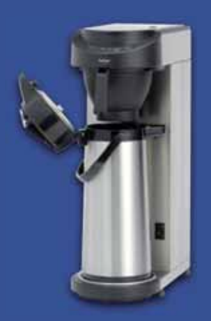
MT200 Coffee brewer with water connection