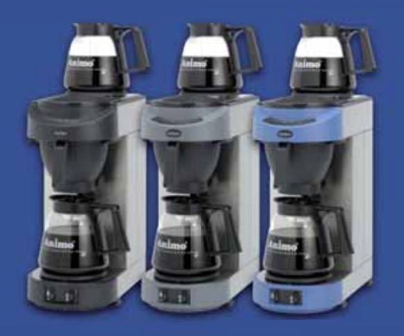
M100 Coffee brewer with manual filling, available in black, grey and blue