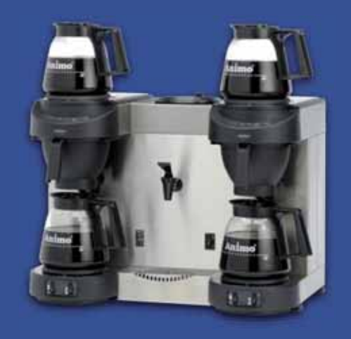
M2O2W Double coffee brewer with water connection and hot water tap for tea or soup