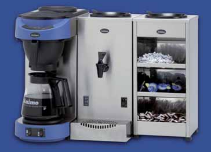
INGREDIENT BOX Stainless steel ingredients box for storage of milk, sugar, spoons, etc.