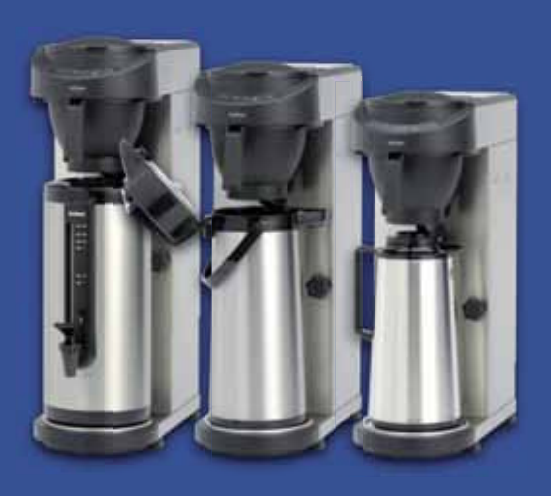
MT100v/MT200v Coffee brewer adjustable in height, suitable for 2,4 litre thermos containers as well as for the 1,85 up to 2,1/2,2 litre thermos jugs. Available with manual filling or with water connection