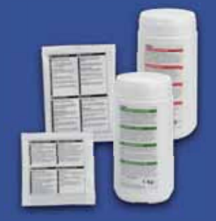
CLEANING AGENT Animo offers a special descaling agent to descale the machine and a coffee fur remover