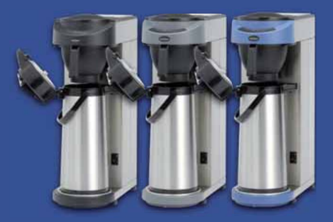
MT100 Coffee brewer with manual filling, available in black, grey and blue