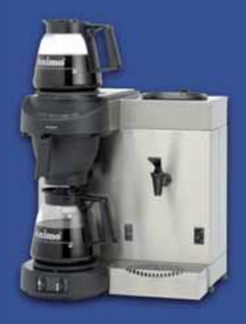
M200W Coffee brewer with water connection and hot water tap for tea or soup