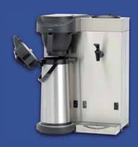
MT200Wp Coffee brewer for thermos jug with pump, with water connection and hot water tap for tea or soup