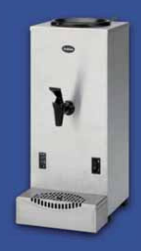
WKT3n Water boiler with manual filling or water connection

Animo M-Line machines offer the following options and accessories: