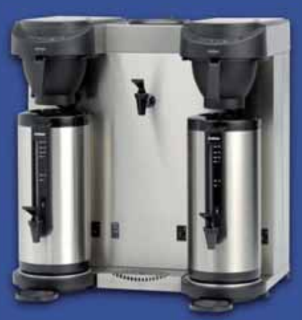
MT202W Coffee brewer with water connection and hot water tap for tea or soup