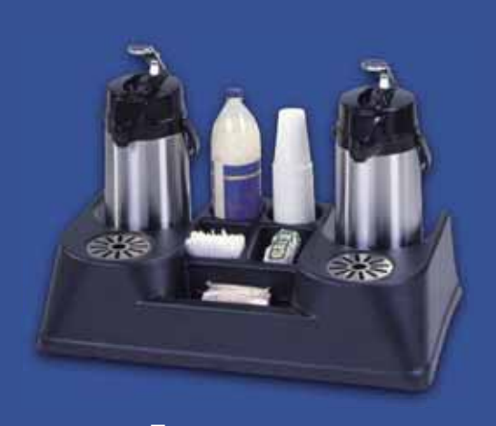
THERMOS JUG BUFFET Thermos jug buffet for two thermos jugs and compartments for ingredients