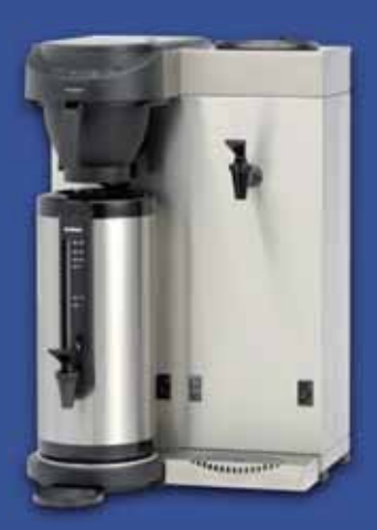
MT200W Coffee brewer with water connection and hot water tap for tea or soup