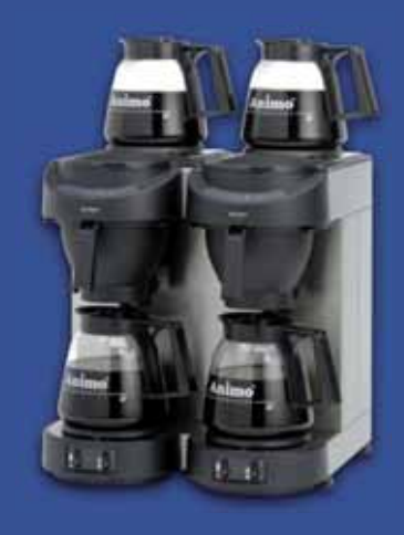
M102/202 Double coffee brewer, available with manual filling or water connection